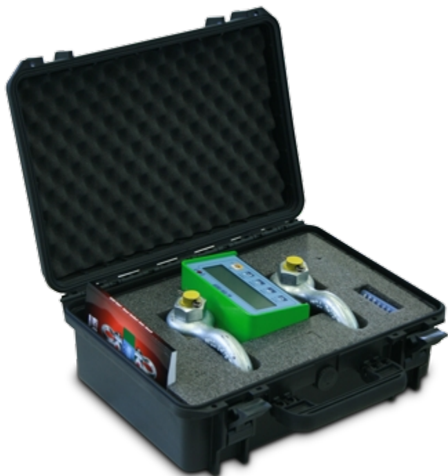
Protective transport case