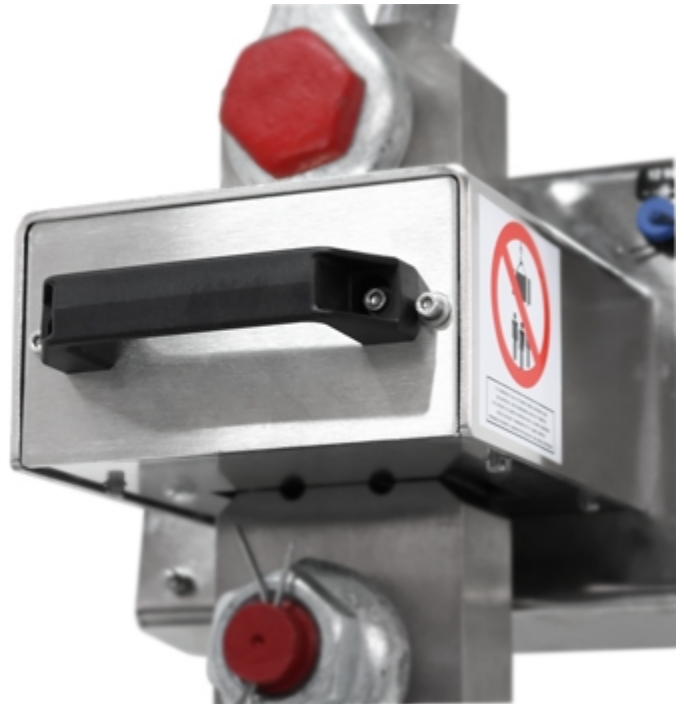
Crane scale MCW09: extractable battery view