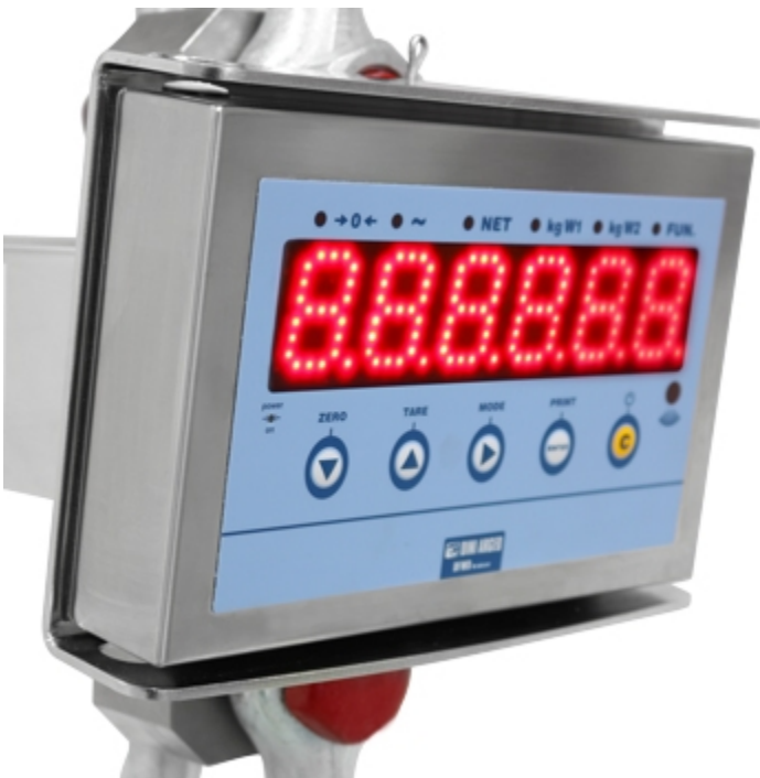
Crane scale MCW09: extra-bright 40mm display